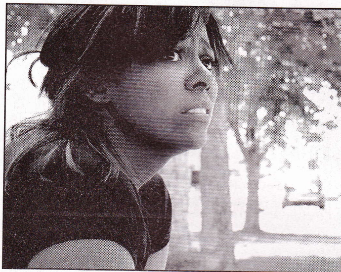
BLACK GIRL LOST , August 8, 9

Festival panel discussion Free admission!