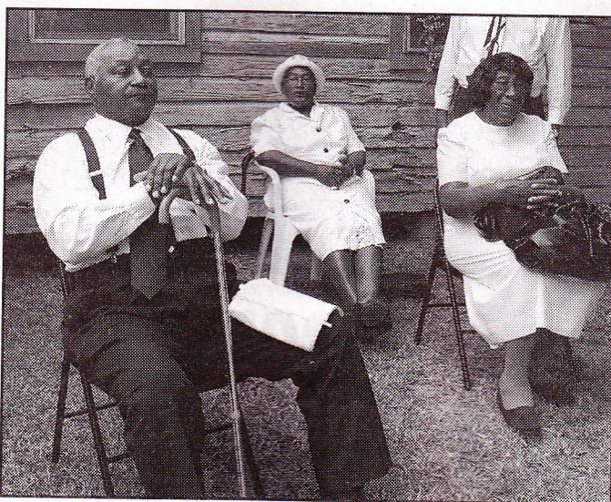
THE CONTRADICTIONS OF FAIR HOPE , August 19, 20

This insightful documentary follows two top Dominican Republic baseball prospects who, like thousands of others, pursue the multimillion-dollar signing bonuses that represent a parachute out of poverty. But the Dominican system is riddled with age-faking and identity-fraud—accusations of which threaten to destroy the dreams of the film's protagonists.